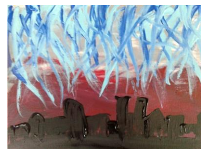
Paintings by Raging Colors Participants