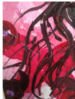
Paintings by Raging Colors Participants