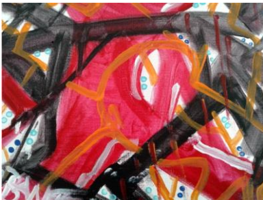
Paintings by Raging Colors Participants