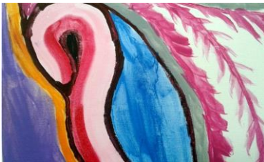
Paintings by Raging Colors Participants